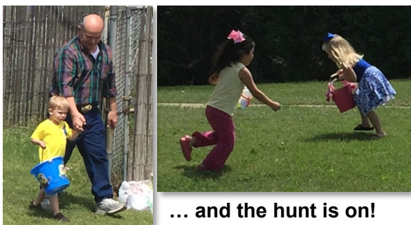
... and the hunt is on!