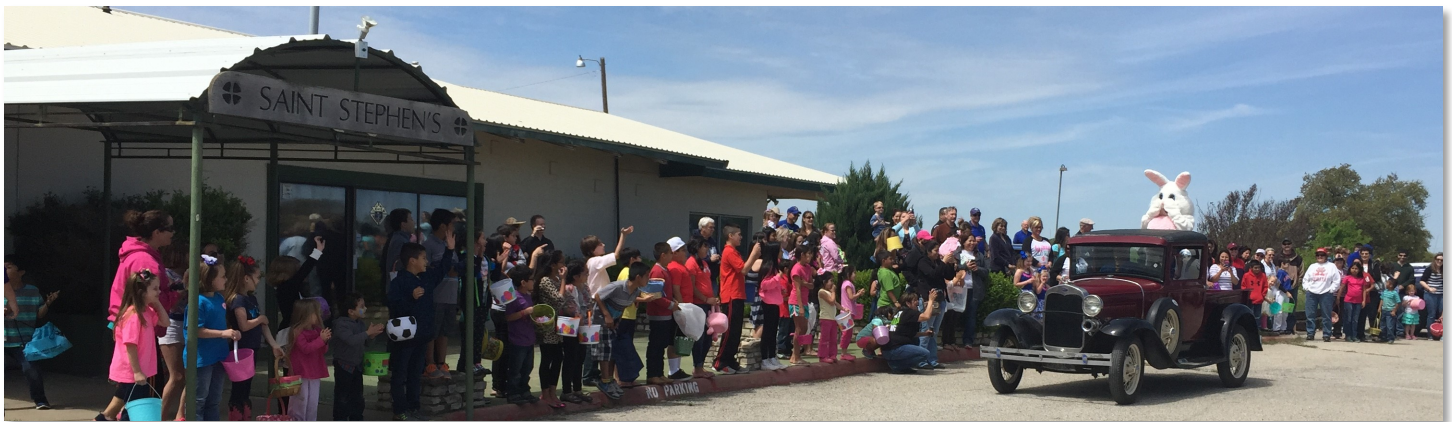
Everyone cheers as the Easter Bunny arrives. Now that's "hopping down the bunny trail" in style!