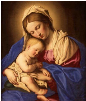
Madonna and Child, Giovanni Battista Salvi, il Sassoferrato, 17th century, Chambéry ; musée des beaux-arts

What better month than May to honor Mary, the Blessed Mother? As we celebrate Mother’s Day in May to acclaim all mothers and the importance of